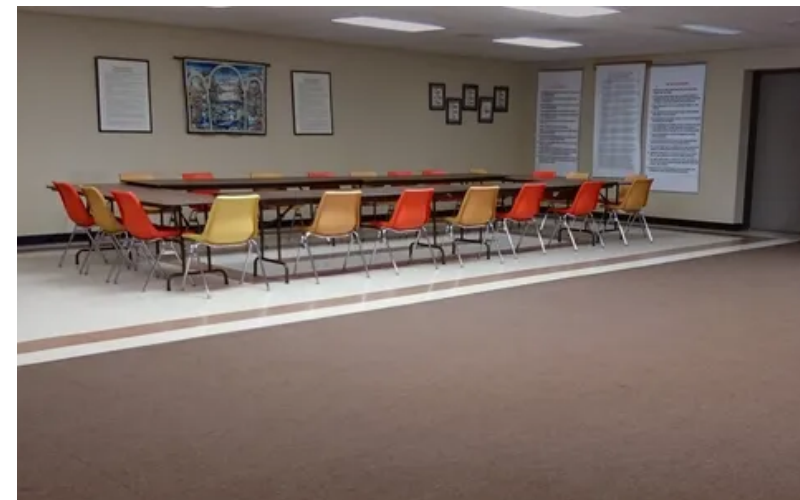
image: The REMMSCO Annex/Main Office includes a space where meetings, classes, and other events take place.