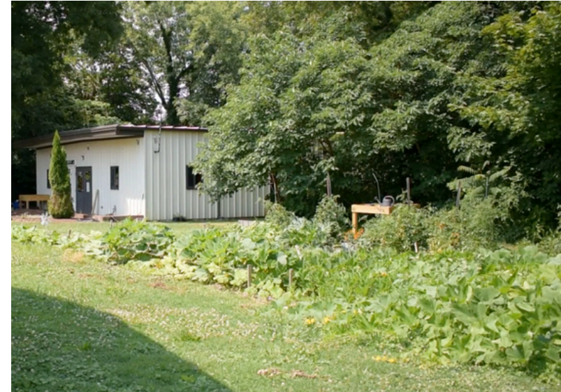
image: Produce grown here at the REMMSCO garden is nurtured by and goes directly to the residents.

Cost of produce returned to local food system